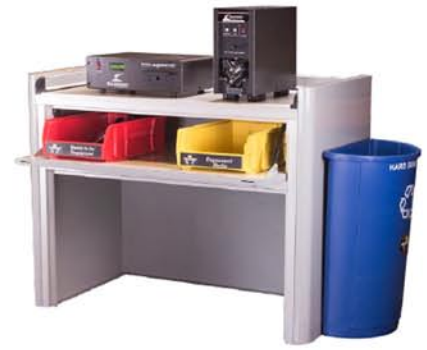
Complete Degauss Destroy Recycle Workstation DDR-25