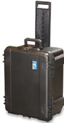
MIL SPEC Transport case