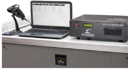
HD-2 with optional SCAN-2 enables audit worthy destruction reports.

Combine the HD-2 Degausser with a PD-4 Hard Drive Destroyer or PD-5 Hard Drive & Solid State Memory Destroyer and our custom-configured SW-2 Table with media bins. The SW-2 Table features a locked storage compartment for securely storing media awaiting erasure.