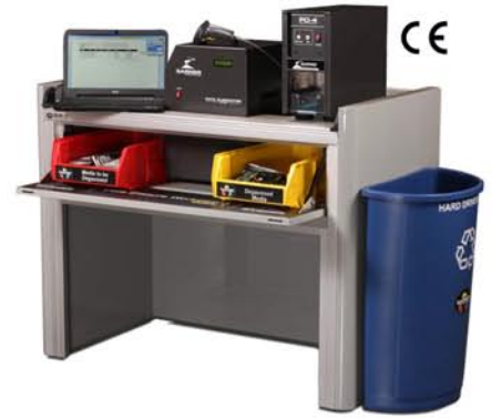
Complete Degauss Destroy Recycle Workstation DDR-34 with optional SCAN-1 (laptop not included)