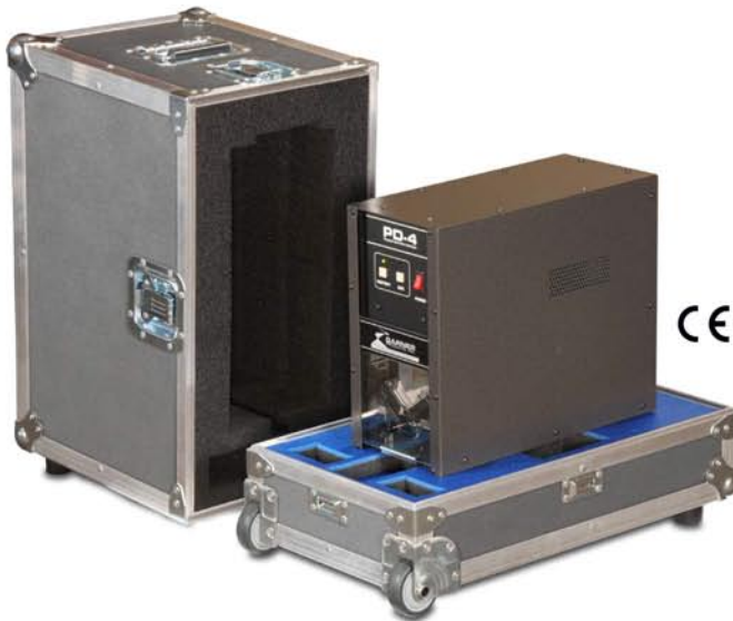
PD-4 in MIL SPEC transport case