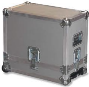
MIL SPEC Transport case