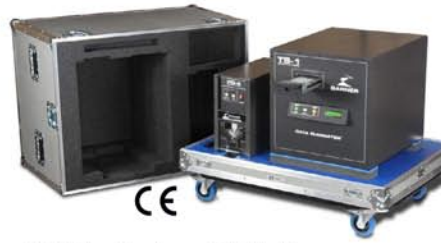
Mobility Package DDM-14

Configure a system to match your needs. Our optional MIL-SPEC transport case with built-in wheels makes it easy to transport the PD-4 to offsite data locations. To ensure data can never be retrieved, pair the PD-4 with our NSA/CSS EPL-listed TS-1 degausser, feature-filled HD-3WXL degausser, or budget-friendly HD-2 degausser.