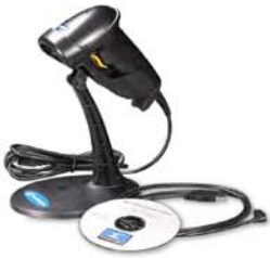
SCAN-1 Media Destruction Report Generator