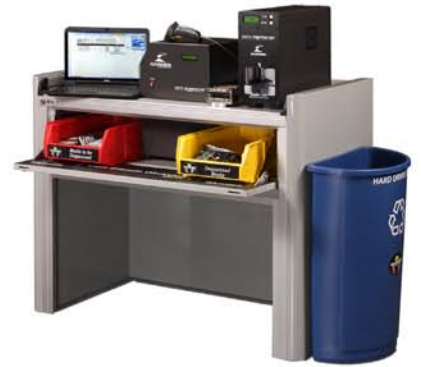
Complete Degauss Destroy Recycle Workstation DDR-35 with optional SCAN-1 and SSD-1 (laptop not included)