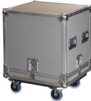
MIL SPEC Transport case